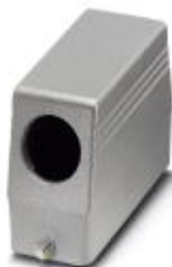
HEAVYCON sleeve housing B24, for single locking latch, height 76 mm, without support 1x M32, lateral conductor exit

Please be informed that the data shown in this PDF Document is generated from our Online Catalog. Please find the complete data in the user's documentation. Our General Terms of Use for Downloads are valid ( http://phoenixcontact.com/download )