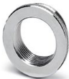
Reducing adapter, material: Brass, nickel-plated, connecting thread: M20 x 1.5, color: silver, with O-ring

Please be informed that the data shown in this PDF Document is generated from our Online Catalog. Please find the complete data in the user's documentation. Our General Terms of Use for Downloads are valid ( http://phoenixcontact.com/download )