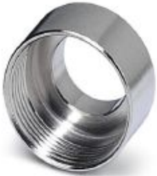
Step-up adapter, M20 to M25, including O-ring

Please be informed that the data shown in this PDF Document is generated from our Online Catalog. Please find the complete data in the user's documentation. Our General Terms of Use for Downloads are valid ( http://phoenixcontact.com/download )