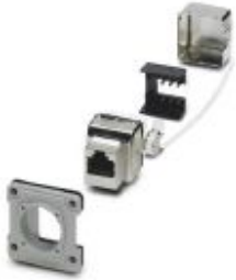
RJ45 panel mounting frame, IP67, modular (keystone), for rectangular mounting cutouts, with seal, without mounting screws, with modular RJ45 socket insert, CAT5e, socket to LSA

Please be informed that the data shown in this PDF Document is generated from our Online Catalog. Please find the complete data in the user's documentation. Our General Terms of Use for Downloads are valid ( http://phoenixcontact.com/download )