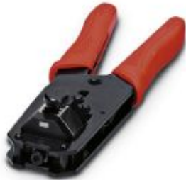
Crimp tool, pliers with die, for RJ45 pin inserts VS-08-ST-H...-RJ45 and VS-08-RJ45-10G/C

Please be informed that the data shown in this PDF Document is generated from our Online Catalog. Please find the complete data in the user's documentation. Our General Terms of Use for Downloads are valid ( http://phoenixcontact.com/download )