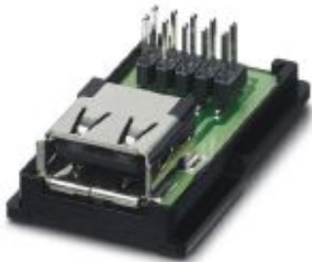
USB socket insert, 4-pos., socket USB type A on flat-ribbon cable terminal strip, pitch 2.54, for the Freenet system in the panel mounting frame, IP20 terminal outlet, 19" patch panel and service interface

Please be informed that the data shown in this PDF Document is generated from our Online Catalog. Please find the complete data in the user's documentation. Our General Terms of Use for Downloads are valid ( http://phoenixcontact.com/download )