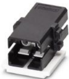
SC-RJ coupling insert, duplex, for VS-PP-19-1HE-16-F patch panel, VS-TO...F... terminal outlets, and VS-SI-FP-2F front plate, can be used for GOF (multi-mode and single mode), HCS, and polymer fiber types

Please be informed that the data shown in this PDF Document is generated from our Online Catalog. Please find the complete data in the user's documentation. Our General Terms of Use for Downloads are valid ( http://phoenixcontact.com/download )