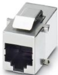
RJ45 socket insert, modular (Keystone), CAT3, 8-pos., shielded, socket on socket

Please be informed that the data shown in this PDF Document is generated from our Online Catalog. Please find the complete data in the user's documentation. Our General Terms of Use for Downloads are valid ( http://phoenixcontact.com/download )