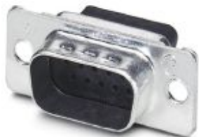
D-SUB contact carrier, shell size 1, for 15 signal contacts, type of contact pin, for crimp contacts, straight, fixing with a 3 mm hole, for panel mounting frame and sleeve housing VS-09-...

Please be informed that the data shown in this PDF Document is generated from our Online Catalog. Please find the complete data in the user's documentation. Our General Terms of Use for Downloads are valid ( http://phoenixcontact.com/download )