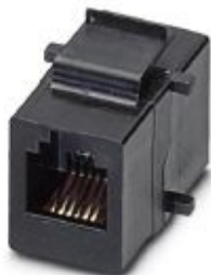
Socket insert RJ11, modular system (Keystone), 6-pos., unshielded

Please be informed that the data shown in this PDF Document is generated from our Online Catalog. Please find the complete data in the user's documentation. Our General Terms of Use for Downloads are valid ( http://phoenixcontact.com/download )