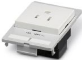
Ground contact socket, plastic, for USA

Please be informed that the data shown in this PDF Document is generated from our Online Catalog. Please find the complete data in the user's documentation. Our General Terms of Use for Downloads are valid ( http://phoenixcontact.com/download )