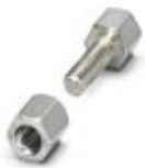
Mounting set, for DSUB gender changer contact inserts