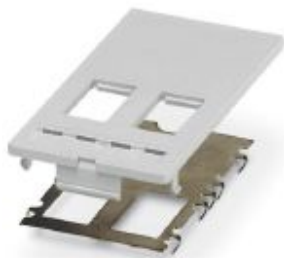
Front plate, plastic with shroud, for 2x RJ with modular system (Keystone)

Please be informed that the data shown in this PDF Document is generated from our Online Catalog. Please find the complete data in the user's documentation. Our General Terms of Use for Downloads are valid ( http://phoenixcontact.com/download )