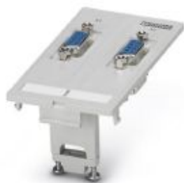
Front plate with contact inserts, plastic, 2x D-SUB 9, socket/pin

Please be informed that the data shown in this PDF Document is generated from our Online Catalog. Please find the complete data in the user's documentation. Our General Terms of Use for Downloads are valid ( http://phoenixcontact.com/download )