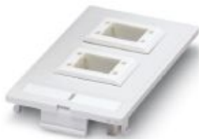
Front plate, plastic, with two Freenet slots

Please be informed that the data shown in this PDF Document is generated from our Online Catalog. Please find the complete data in the user's documentation. Our General Terms of Use for Downloads are valid ( http://phoenixcontact.com/download )