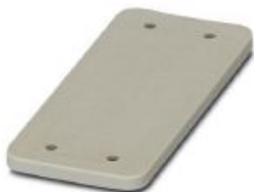
HEAVYCON cover plate, for wall cutouts of type D15, 3.5 mm thick, gray

Please be informed that the data shown in this PDF Document is generated from our Online Catalog. Please find the complete data in the user's documentation. Our General Terms of Use for Downloads are valid ( http://phoenixcontact.com/download )