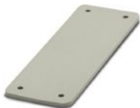
HEAVYCON cover plate, for wall cutouts of type D25, 3.5 mm thick, gray

Please be informed that the data shown in this PDF Document is generated from our Online Catalog. Please find the complete data in the user's documentation. Our General Terms of Use for Downloads are valid ( http://phoenixcontact.com/download )