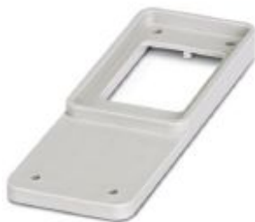
HEAVYCON adapter plate, type B24 on B6, for panel cutouts of type B24, gray

Please be informed that the data shown in this PDF Document is generated from our Online Catalog. Please find the complete data in the user's documentation. Our General Terms of Use for Downloads are valid ( http://phoenixcontact.com/download )