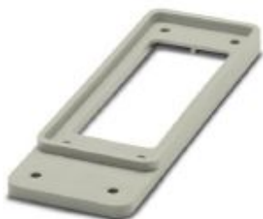
HEAVYCON adapter plate, type B24 on B16, for panel cutouts of type B24, gray

Please be informed that the data shown in this PDF Document is generated from our Online Catalog. Please find the complete data in the user's documentation. Our General Terms of Use for Downloads are valid ( http://phoenixcontact.com/download )