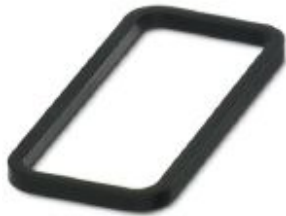
Replacement profile gasket for HC-D15 sleeve housing

Please be informed that the data shown in this PDF Document is generated from our Online Catalog. Please find the complete data in the user's documentation. Our General Terms of Use for Downloads are valid ( http://phoenixcontact.com/download )