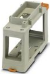
Plug assembly board, 150 mm, with base element, snaps onto NS 35/7.5 and NS 35/15, for contact inserts HC-D 25

Please be informed that the data shown in this PDF Document is generated from our Online Catalog. Please find the complete data in the user's documentation. Our General Terms of Use for Downloads are valid ( http://phoenixcontact.com/download )