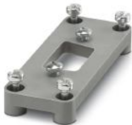
D-SUB adapter plate, for one D-SUB connector, no. of positions 9, housing series HC-D 15...

Please be informed that the data shown in this PDF Document is generated from our Online Catalog. Please find the complete data in the user's documentation. Our General Terms of Use for Downloads are valid ( http://phoenixcontact.com/download )