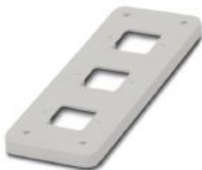
HEAVYCON adapter plate with a reinforced wall, three openings for D7 panel mounting base; type B24 on 3xD7, for panel cutouts of type B24; gray

Please be informed that the data shown in this PDF Document is generated from our Online Catalog. Please find the complete data in the user's documentation. Our General Terms of Use for Downloads are valid ( http://phoenixcontact.com/download )