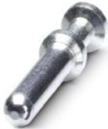
Turned 4.0 crimp contact, individual male contact, core diameter 2.50 mm 2 , silver-plated

Please be informed that the data shown in this PDF Document is generated from our Online Catalog. Please find the complete data in the user's documentation. Our General Terms of Use for Downloads are valid ( http://phoenixcontact.com/download )