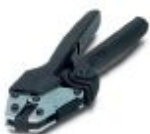
Crimping pliers, for CK 4,0... contacts, for 4.0 - 6.0 mm 2 conductor cross sections

Crimping pliers - CRIMPFOX-4,0-ED-6,00 - 1205859