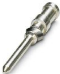
Turned 1.6 crimp contact, individual male contact, core diameter 0.14 to 0.37 mm 2 , silver-plated

Please be informed that the data shown in this PDF Document is generated from our Online Catalog. Please find the complete data in the user's documentation. Our General Terms of Use for Downloads are valid ( http://phoenixcontact.com/download )