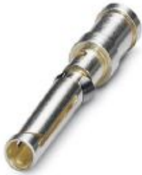
Turned 1.6 crimp contact, individual female contact, core diameter 1.5 mm 2 , silver-plated

Please be informed that the data shown in this PDF Document is generated from our Online Catalog. Please find the complete data in the user's documentation. Our General Terms of Use for Downloads are valid ( http://phoenixcontact.com/download )