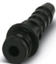
Pneumatic pin, for HC-M-PN3 module, internal hose diameter of 4.0 mm

Please be informed that the data shown in this PDF Document is generated from our Online Catalog. Please find the complete data in the user's documentation. Our General Terms of Use for Downloads are valid ( http://phoenixcontact.com/download )