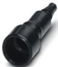
Pneumatic socket, for HC-M-PN3 module, internal hose diameter of 3.0 mm

Please be informed that the data shown in this PDF Document is generated from our Online Catalog. Please find the complete data in the user's documentation. Our General Terms of Use for Downloads are valid ( http://phoenixcontact.com/download )