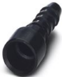
Pneumatic socket, for HC-M-PN3 module, internal hose diameter of 4.0 mm

Please be informed that the data shown in this PDF Document is generated from our Online Catalog. Please find the complete data in the user's documentation. Our General Terms of Use for Downloads are valid ( http://phoenixcontact.com/download )