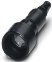
Pneumatic socket with valve, for HC-M-PN3 module, internal hose diameter of 3.0 mm

Please be informed that the data shown in this PDF Document is generated from our Online Catalog. Please find the complete data in the user's documentation. Our General Terms of Use for Downloads are valid ( http://phoenixcontact.com/download )