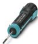
Assembly tool, for CK 1.6... crimp contacts for small conductor cross sections

Assembly tool - UNIFOX MT-CK 1.6/2.5 - 1089092