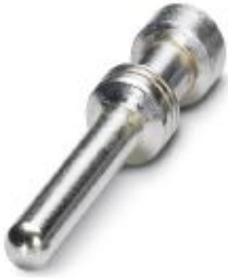
Turned 2.5 crimp contact, individual male contact, core diameter 4.00 mm 2 , silver-plated

Please be informed that the data shown in this PDF Document is generated from our Online Catalog. Please find the complete data in the user's documentation. Our General Terms of Use for Downloads are valid ( http://phoenixcontact.com/download )