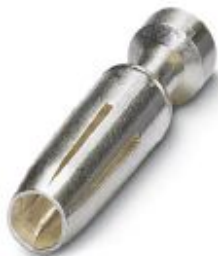
Turned 2.5 crimp contact, individual female contact, core diameter 0.75 to 1.00 mm 2 , silver-plated

Please be informed that the data shown in this PDF Document is generated from our Online Catalog. Please find the complete data in the user's documentation. Our General Terms of Use for Downloads are valid ( http://phoenixcontact.com/download )