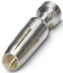
Turned 2.5 crimp contact, individual female contact, core diameter 1.5 mm 2 , silver-plated

Please be informed that the data shown in this PDF Document is generated from our Online Catalog. Please find the complete data in the user's documentation. Our General Terms of Use for Downloads are valid ( http://phoenixcontact.com/download )