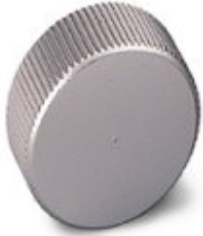
M23 metal sealing cap, for unoccupied M23 connectors, without steel wire

Please be informed that the data shown in this PDF Document is generated from our Online Catalog. Please find the complete data in the user's documentation. Our General Terms of Use for Downloads are valid ( http://phoenixcontact.com/download )