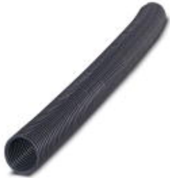
Protective hose, for protective house screw connection, packing volume: 25 m, Pg29

Please be informed that the data shown in this PDF Document is generated from our Online Catalog. Please find the complete data in the user's documentation. Our General Terms of Use for Downloads are valid ( http://phoenixcontact.com/download )