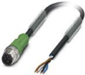
Sensor/actuator cable, 4-position, PUR halogen-free, black-gray RAL 7021, Plug straight M12, coding: A, on free cable end, cable length: 1.5 m

Please be informed that the data shown in this PDF Document is generated from our Online Catalog. Please find the complete data in the user's documentation. Our General Terms of Use for Downloads are valid ( http://phoenixcontact.com/download )