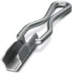
Allen wrench, for loosening and fastening the QUICKON union nut, WAF 22 mm

Please be informed that the data shown in this PDF Document is generated from our Online Catalog. Please find the complete data in the user's documentation. Our General Terms of Use for Downloads are valid ( http://phoenixcontact.com/download )