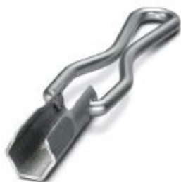
Allen wrench, for loosening and fastening the QUICKON union nut, WAF 27 mm

Please be informed that the data shown in this PDF Document is generated from our Online Catalog. Please find the complete data in the user's documentation. Our General Terms of Use for Downloads are valid ( http://phoenixcontact.com/download )