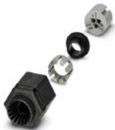
Locking nut, can only be released with Allen wrench, coding 2

Please be informed that the data shown in this PDF Document is generated from our Online Catalog. Please find the complete data in the user's documentation. Our General Terms of Use for Downloads are valid ( http://phoenixcontact.com/download )