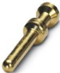
Turned 2.5 crimp contact, individual male contact, core diameter 1.5 mm 2 , gold-plated

Please be informed that the data shown in this PDF Document is generated from our Online Catalog. Please find the complete data in the user's documentation. Our General Terms of Use for Downloads are valid ( http://phoenixcontact.com/download )