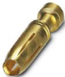
Turned 2.5 crimp contact, individual female contact, core diameter 1.5 mm 2 , gold-plated

Please be informed that the data shown in this PDF Document is generated from our Online Catalog. Please find the complete data in the user's documentation. Our General Terms of Use for Downloads are valid ( http://phoenixcontact.com/download )