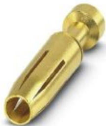
Turned 2.5 crimp contact, individual female contact, core diameter 4.00 mm 2 , gold-plated

Please be informed that the data shown in this PDF Document is generated from our Online Catalog. Please find the complete data in the user's documentation. Our General Terms of Use for Downloads are valid ( http://phoenixcontact.com/download )