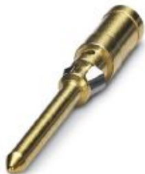
Turned 1.6 crimp contact, individual male contact, core diameter 2.5 mm 2 , gold-plated

Please be informed that the data shown in this PDF Document is generated from our Online Catalog. Please find the complete data in the user's documentation. Our General Terms of Use for Downloads are valid ( http://phoenixcontact.com/download )