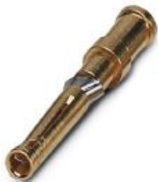
Turned 1.6 crimp contact, individual female contact, core diameter 2.5 mm 2 , gold-plated

Please be informed that the data shown in this PDF Document is generated from our Online Catalog. Please find the complete data in the user's documentation. Our General Terms of Use for Downloads are valid ( http://phoenixcontact.com/download )