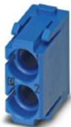
HEAVYCON pneumatic module, male/female, 2 connections

Please be informed that the data shown in this PDF Document is generated from our Online Catalog. Please find the complete data in the user's documentation. Our General Terms of Use for Downloads are valid ( http://phoenixcontact.com/download )