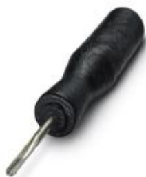
Assembly tool, for CK 1.6... crimp contacts for small conductor cross sections

Please be informed that the data shown in this PDF Document is generated from our Online Catalog. Please find the complete data in the user's documentation. Our General Terms of Use for Downloads are valid ( http://phoenixcontact.com/download )