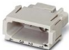
HEAVYCON contact insert module, 4-pos., for HC-M-04-ST-KOAX... coaxial contacts

Please be informed that the data shown in this PDF Document is generated from our Online Catalog. Please find the complete data in the user's documentation. Our General Terms of Use for Downloads are valid ( http://phoenixcontact.com/download )