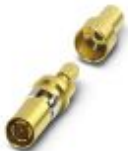
Coaxial contact, contact diameter: 4.8 mm, turned, Pin, contact material: Copper alloy, contact surface: gold-plated, connection cross section: 0.14 mm 2 ... 2.5 mm 2 AWG 26 ... 14, Wave impedance: 50 Ω

Coaxial contact - HC-M-04-ST-KOAX-50 - 1676815